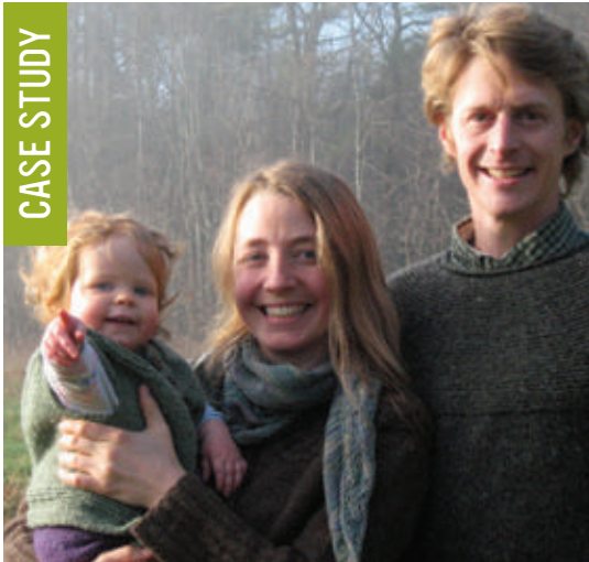
Maine Farmland Trust