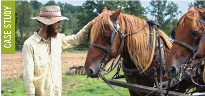
Great Song Farm