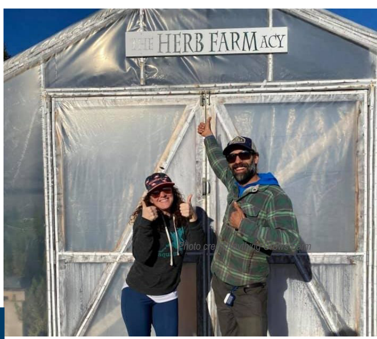
Anything Grows Farm, Salisbury, MA.

I recommend many of your resources to the farmers and landowners I serve. I know it's helped a lot of people make more informed decisions!